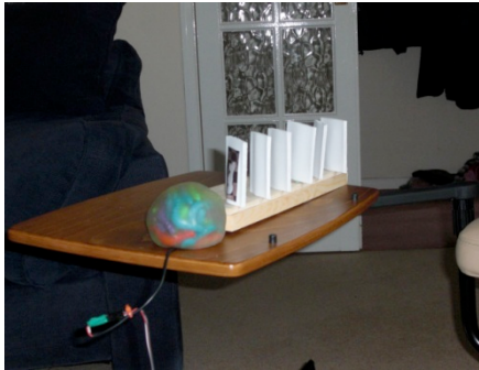
Figure 1: Tangible chess board

could develop a technology so that he could play chess and exercise his hand and arm at the same time.